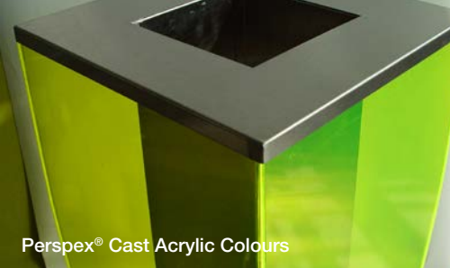
Perspex® Cast Acrylic Colours