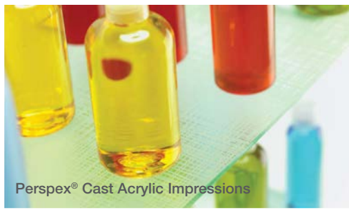
Perspex® Cast Acrylic Impressions