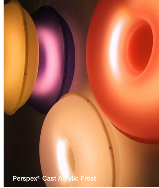
Perspex® Cast Acrylic Frost