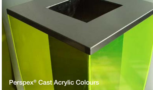
Perspex® Cast Acrylic Colours