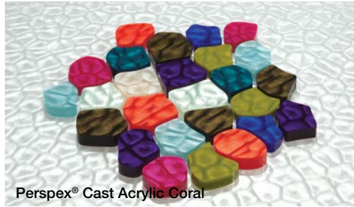
Perspex® Cast Acrylic Coral