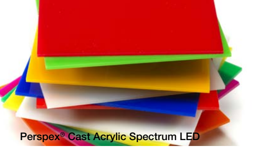
Perspex® Cast Acrylic Spectrum LED