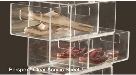
Perspex® Clear Acrylic Sheet