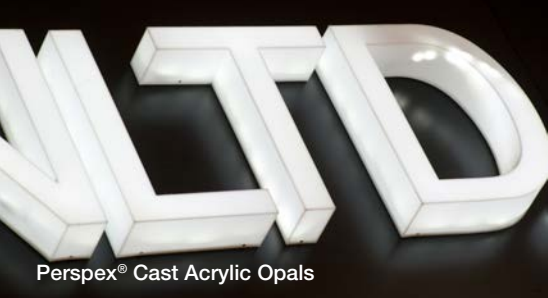
Perspex® Cast Acrylic Opals