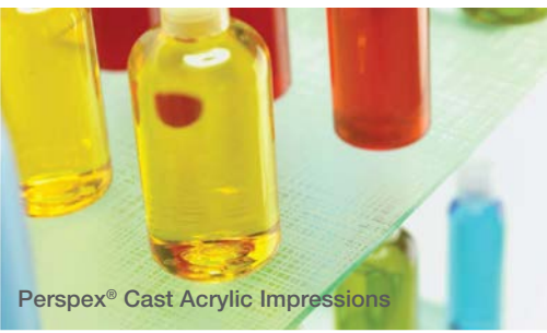
Perspex® Cast Acrylic Impressions